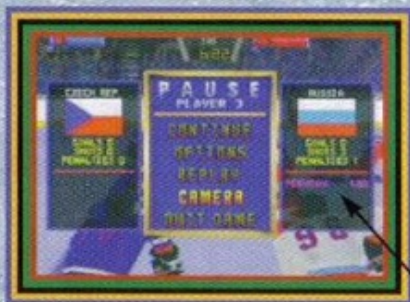
Penalty Information (purple text)

At each stoppage of play, a window will appear listing all penalties. If a signalled minor penalty has been cancelled due to a scored goal, it will be displayed in grey.